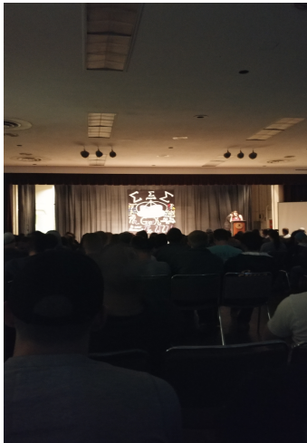
Sigma Sigma Sigma philanthropy Mr. Greek.