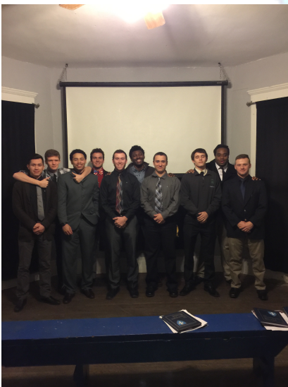
Iota Eta pledge class