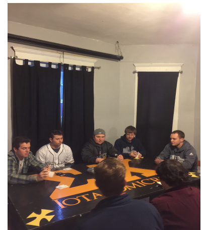
Brothers playing cards with the potential new members