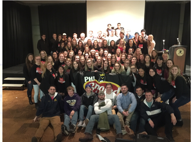
PHI SIGMA SIGMA WITH SIGMA CHI GROUP PHOTO

On February 8 th , we got to attend the Phi Sigma Sigma philanthropy event "Phi Singed Out." Not only did we have a good time attending the event, but we also had lots of fun watching our own brothers on stage competing to win a date with a member of Phi Sigma Sigma. In fact, one of our brothers made it to the top three, but didn't end up winning. We still got a good laugh out of it.